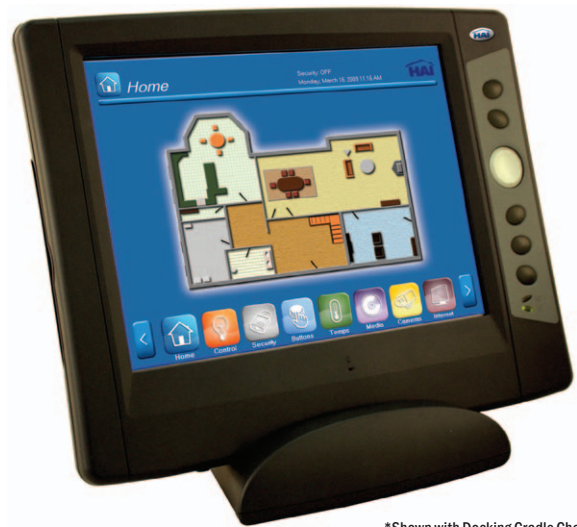
*Shown with Docking Cradle Charger (HAI Part Number 67A01-1) available separately.