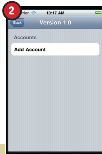
Step 2: Touch “Add Account” to add a new account.