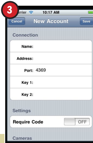
Step 3: Enter your Name, Address, Port, Key 1, & Key 2.