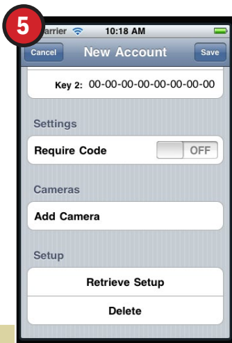
Step 5: Scroll down and touch the “Retrieve Setup” button to download your HAI home automation controller setup.