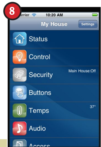
Step 8: Upon connecting to an activated account, you will be able to scroll this screen of category icons for automated systems.