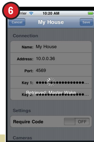
Step 6: Wait for the data to completely download. After download completes, touch the “Save” button located in the top-right corner.