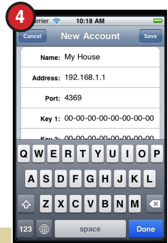
Step 4: Touch “Done” to close the keyboard interface and continue activation.